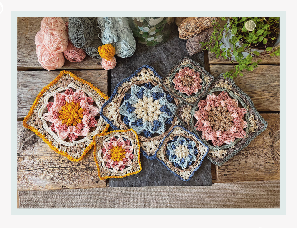
Designed by Therese Eghult